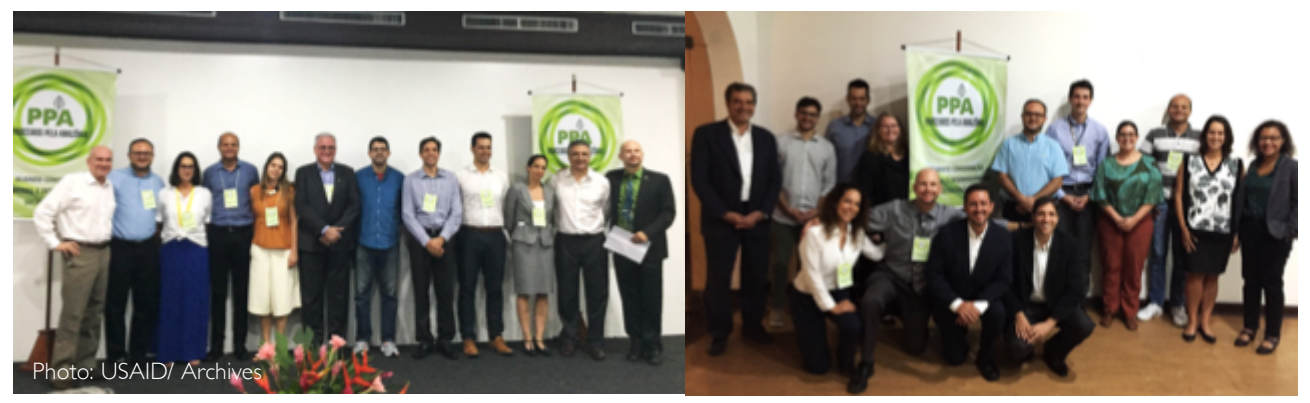
PPA Launch Manaus

Following on the heels of the launch of the USAID-supported PPA, the PPA Steering Committee (SC) met for the first time on December 7th. Initially comprised of 11 companies operating in the Amazon region (Ambev, Coca-Cola, DD&L, Dow, Grupo Bemol, KPMG, Natura, Nova Era, Sinoreg-AM, 3M and Whirlpool) the SC engaged in a lively discussion and eventually agreed on an overall Platform "Mission" of private-sector led responsible investment for a sustainable future for the Amazon The Committee quickly agreed on general governance structures and approaches, and moved to define a work program for 2018, with specific milestones and targets. For the next PPA-SC meeting, scheduled for March 13<sup>th</sup> 2018 in Manaus, the PPA-SC challenged the PPA Secretariat to accomplish the following: a) conduct a complete mapping and review of Amazon-region sustainable production "start-ups", based on other recent such mapping exercises (e.g. Bemol, Coca Cola); b) invite some the most promising start-ups to the March 13<sup>th</sup> PPA meeting to present their