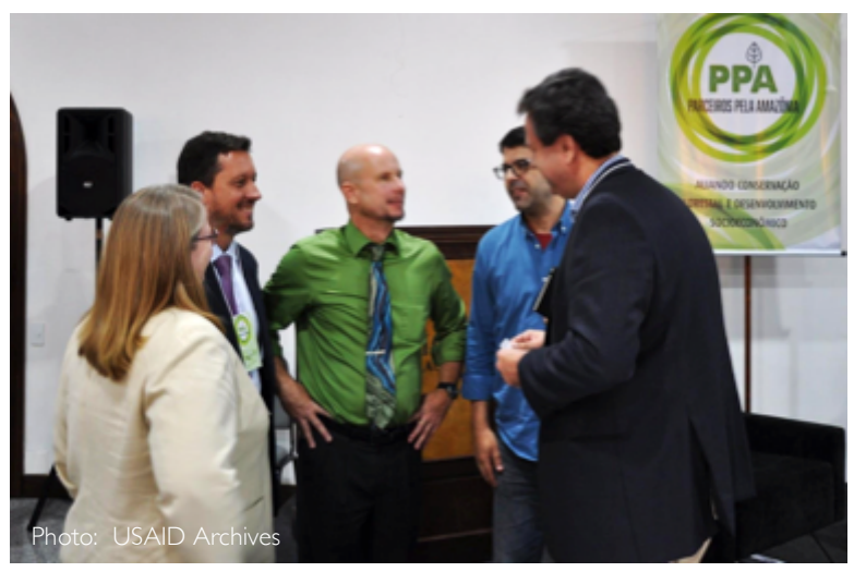
PPA Launch in Manaus

companies presented social environment projects and investments related to sustainable production and development in Amazon communities. The PPA's primary goals are to share successful business cases that generated positive social impact, strengthen sustainable businesses and their productive chains and promote environmental conservation by sharing experiences and best practices. The initiative will promote new national and international partnerships among businesses, civil society, investors, governments and local communities and support entrepreneurs.